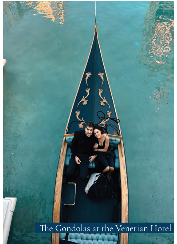
The Gondolas at the Venetian Hotel