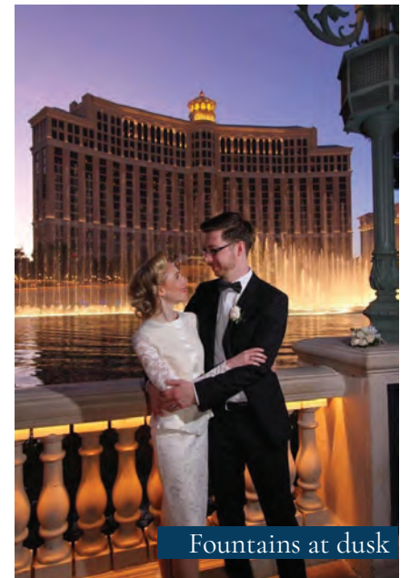
Fountains at dusk