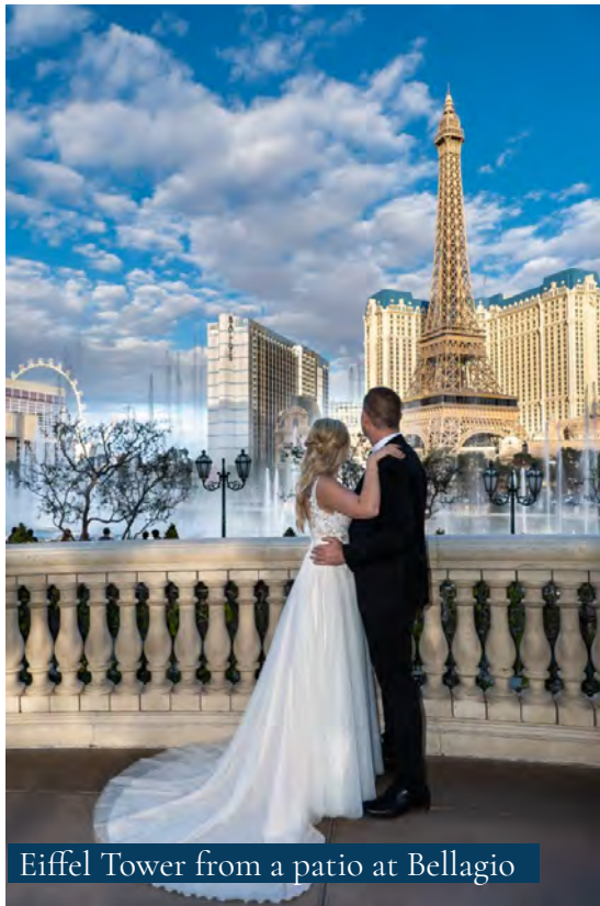
Eiffel Tower from a patio at Bellagio

The corner of Flamingo and Las Vegas Blvd. provides some of Vegas' most iconic backdrops. Immerse yourself in the Bellagio's array of exquisite photo spots: from the vibrant, ever-evolving botanical gardens to the enchanting dance of the Bellagio Fountains, and don't miss the overhead spectacle of the Chihuly glass ceiling sculpture. The Paris Las Vegas and Caesar's Palace are both just across the street.